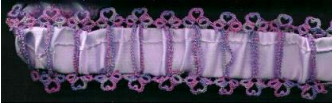
Underneath side of finished garter.